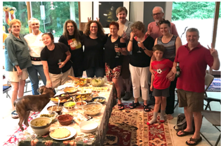
Above photo: First "V3" Potluck, July 2018. Below: "VEG" Ice Cream Social, July 2024.

*Note: cooking chickpeas from their dried form also yields aquafaba.