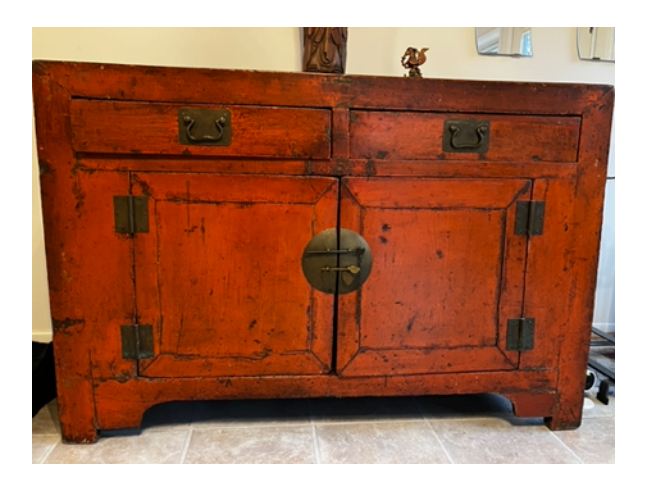
RUSTIC ASIAN CABINET for sale

Zelle, Cash, or Check welcome for payments: 10-class pack, $150; walk-ins, $18 per class.